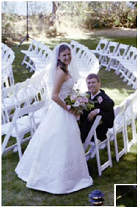
Before the crowd arrives.