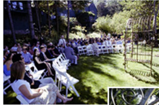
Surrounded by friends.