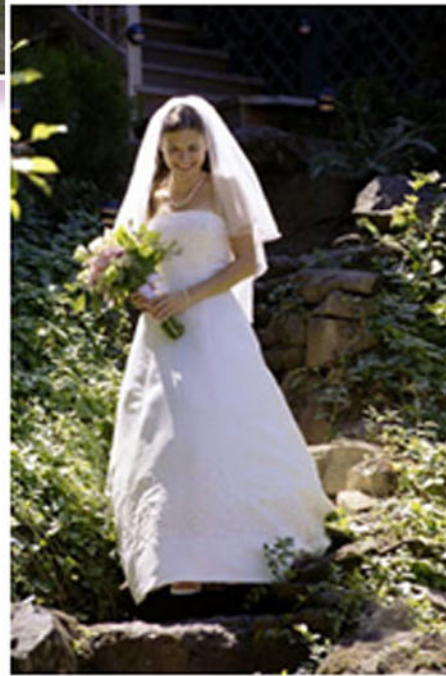
Here comes the bride!