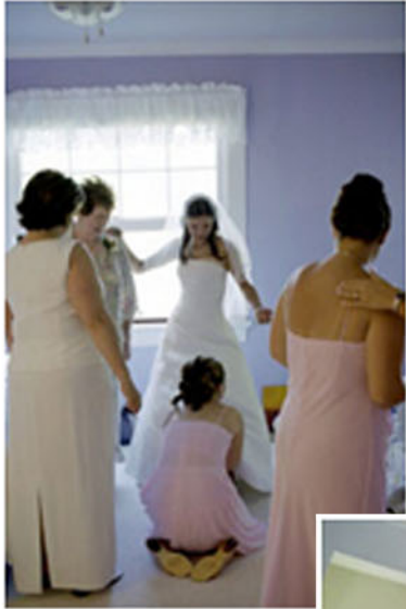
Getting ready in the Lilac Room.