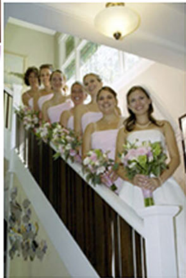
Making an entrance.